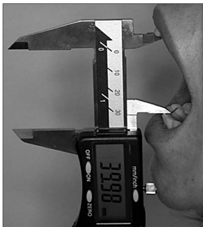
Figure 3. Four year follow-up showed an adequate interincisal distance

Patient remained without pain or TMJ dysfunction after a 4-year follow up.