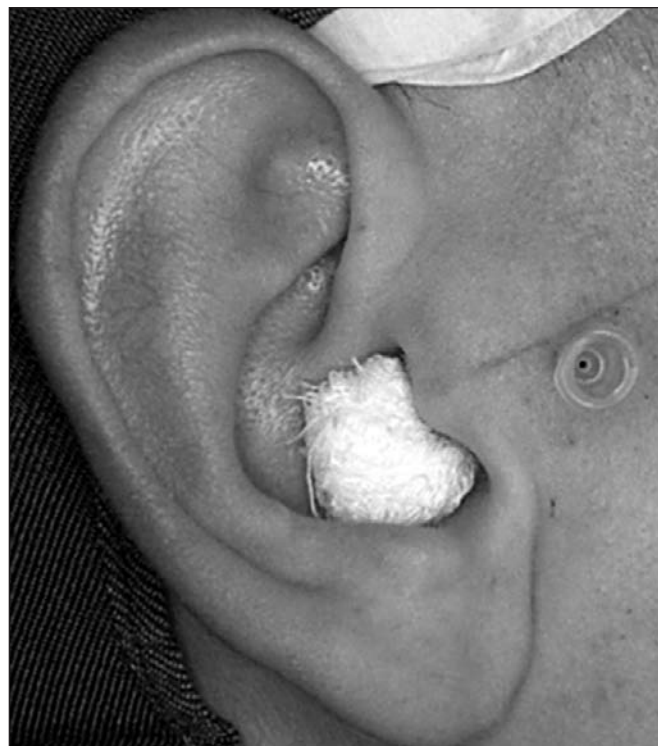
Figure 2. The needle was inserted 10mm anterior to the tragus and 2mm below the tragus line – external corner of the orbital cavity. It was directed anteriorly, superiorly, and medially until the tip of it reached the glenoid fossa close to the upper joint space of the right TMJ

At the end of the treatment, her clinical examination showed the full restoration of the function. Besides, pain had disappeared,